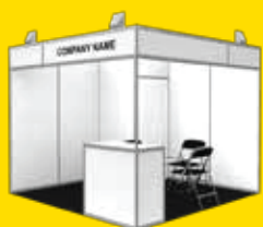
Exhibit Space Cost